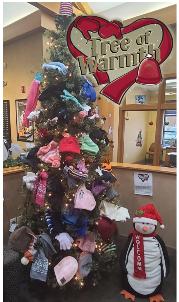
At Minnco's Andover office, the Tree of Warmth was filled with new hats, mittens, gloves, scarves, jackets, and other cold-weather gear to be donated to those in need of warm clothing. Thank you for your generosity!

Minnco's Angel Tree has provided tens of thousands of gifts to local families in need!